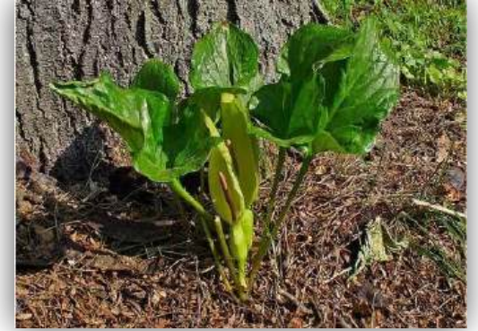
Yılan Yatađı Arum italicum

The Alanya Herbarium Museum houses 115 plant species endemic to Alanya, collected from Alanya Castle. According to scientific sources, 8 of these are endemic species, growing only in the castle area. The three most notable endemic species are Snake's Pillow, Cornflower, and Cakshir (a type of herb). If you wish to visit the museum, please go to the "Sandık Emni Kayhanlar House" in the Hisariçi neighborhood of Alanya Castle. There are no endemic plant species located within the building itself.