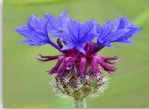
Peygamber Çiçeđi Centaurea kilaea