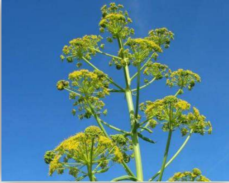
Çakşır Otu Ferula